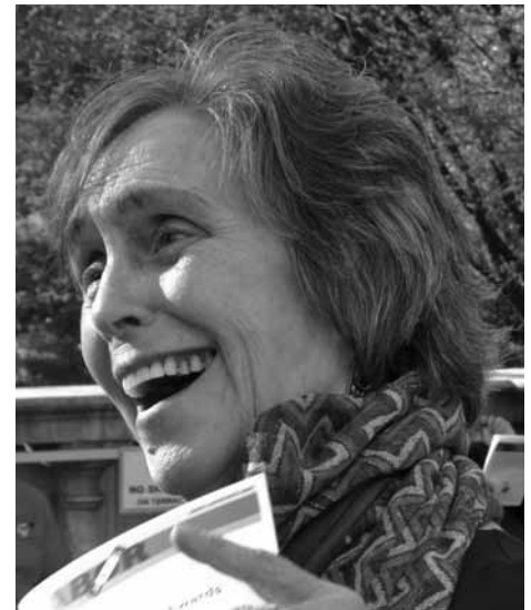
Radical feminist author Alix Kates Shulman