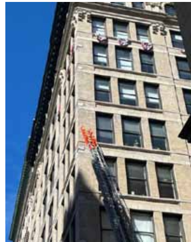
FDNY demonstrates limited reach of ladders in 1911

On October 11, 2023, a large crowd assembled at the corner of Washington Place and Greene Street in New York's Greenwich Village, outside NYU's "Brown Building." At this site on March 25, 1911, the Triangle Shirtwaist Factory Fire consumed the lives of 146 people, mostly young, female Jewish and Italian immigrant workers, unable to