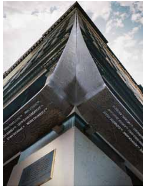
The Memorial, when completed