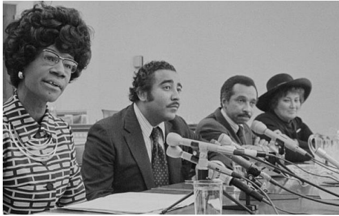
"Congresswoman Shirley Chisholm announcing her candidacy for the presidential nomination" (l-r) Chisholm, Charles B. Rangel, Parren Mitchell, Bella Abzug, January 25, 1972