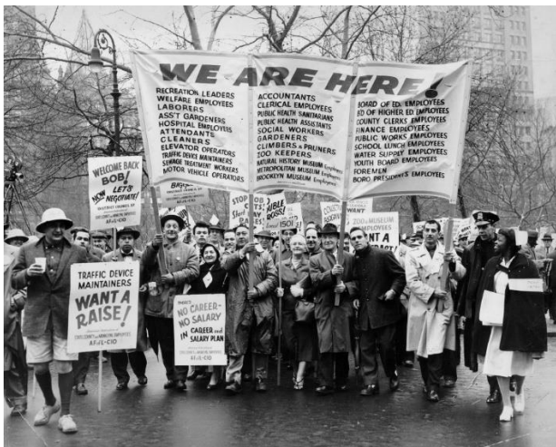
Municipal Workers Organize, 1954

Suggested Donation: $6. (845) 947-3505. info@haverstrawbrickmuseum.org