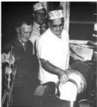
The last can of milk being processed at the Center Street Sealtest plant. 1972 Cortland Standard

$40. New York Transit Museum. Tour will take place off-site. https://www.nytransitmuseum.org/programs/