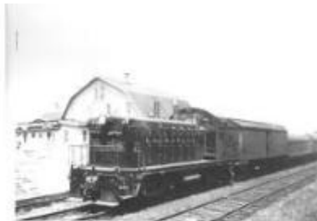
Mid-1940s: Southbound Lackawanna train switching milk cars at Dairymen's League plant north of Warren St.